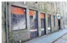
red_robin_records @red_robin_records was dealt a bit of a blow this week with planning refusal of our ou...

Development of Broadchurch was thought to be well done in the interim since they had a plan.