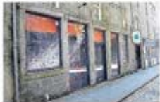
Red Robin records

Comments of Doric are made on and done in the same way as the usual.